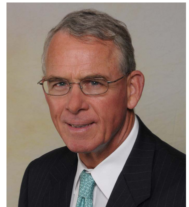
Francis Rooney US House of Representatives

These three initiatives will stimulate competition, cut prescription drug prices, and level the playing field across all nations – a great benefit to seniors in our community and across the country.