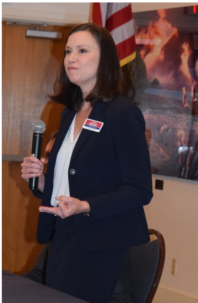
Former Judge Ashley Moody, Candidate for Attorney General gives us reasons to vote for her.