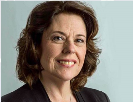
Gina Haspel Director of C.I.A. Nominee

Gina Haspel has been nominated to be the Director of the Central Intelligence Agency (C.I.A.) and if confirmed by the Senate she would be first female CIA Director. Ms. Haspel has received a number of awards including the George H.W. Bush Aware for "Excellence in Counterterrorism", the Donovan Award, the Intelligence Medal of Merit and the Presidential Rank Award. Ms. Haspel joined the CIA in 1985 and served both locally and abroad in several undercover overseas positions in areas such as Turkey, Central Europe and Central Asia. She has been criticized in the media over her interrogation methods used in Thailand. The CIA was founded in 1947 and has been a male dominated agency since that time.