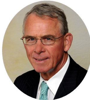
Francis Rooney U.S. Congressman Dist. 19